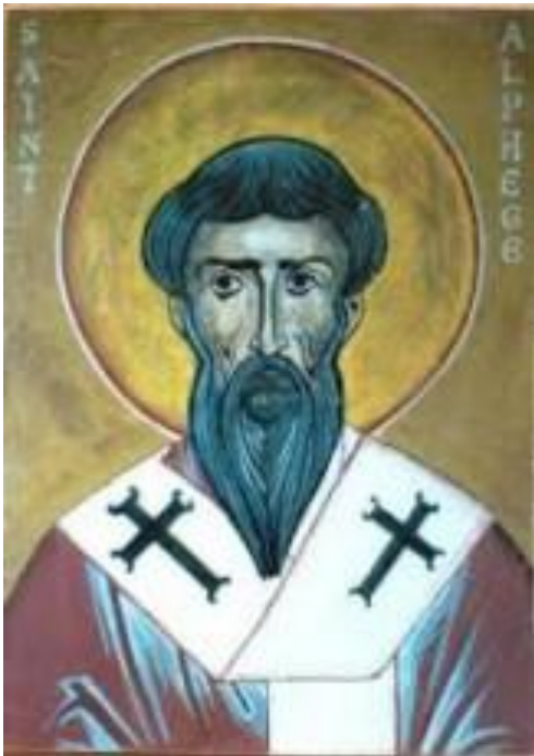
"Saint Alphege – Archbishop of Canterbury." Newman Ministry.

From Lesser Feasts and Fasts, Church Publishing