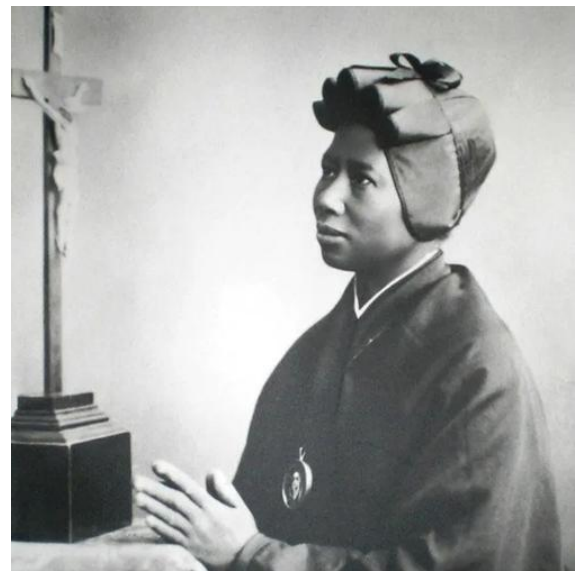
Photograph of Saint Josephine Margaret Bakhita (1869–1947), Daughters of Charity of Canossa sister.

Josephine knew the reality of being a slave, an immigrant, and a spiritual seeker. Even today, countless children, women, and men continue to be victimized and trafficked into slavery. Josephine serves as an inspiration to those who work to free girls and women from oppression and violence, and to return them to their dignity in the full exercise of their rights. Not only is she a model of resistance, Josephine also reminds us of our obligation to strive against the evil and injustice of human trafficking and uphold the dignity of every human person. From Lesser Feasts and Fasts, Church Publishing