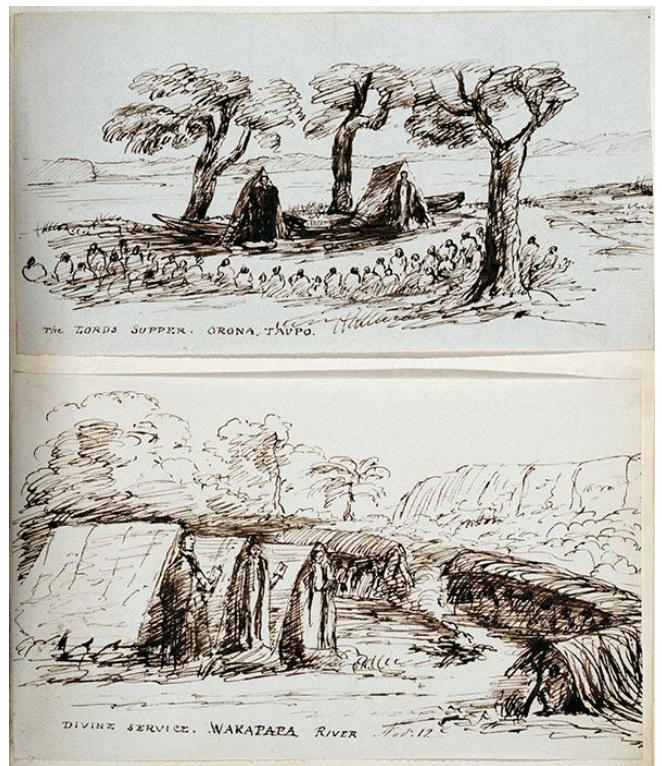
Religious services by Bishop Selwyn, 1843, by George Augustus Selwyn