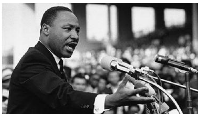
Martin Luther King Jr. at the March on Washington, 1963.

After preaching at Washington Cathedral on March 31, 1968, King went to Memphis in support of sanitation workers in their struggle for better wages. There, he proclaimed that he had been "to the mountaintop" and had seen "the Promised Land," and that he knew that one day he and his people would be "free at last." On the following day, April 4, he was cut down by an assassin's bullet.