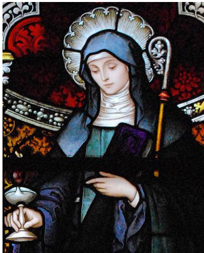
Detail of a stained glass window in St. Joseph's Catholic Church, Macon, Georgia.