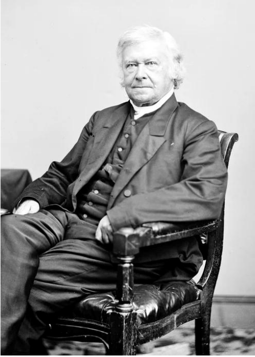
Portrait of Bishop Jackson Kemper (1789–1870), first missionary bishop of the Episcopal Church and pioneer of Episcopal ministry across the American frontier.

When the General Convention of 1835 declared all the members of the Episcopal Church to be members also of the Domestic and Foreign Missionary Society, it provided at the same time for missionary bishops to serve in the wilderness and in foreign countries. Jackson Kemper was the first such bishop. Although he was assigned to Missouri and Indiana, he also laid foundations in Iowa, Wisconsin, Minnesota, Nebraska, and Kansas, and made extensive missionary tours in the South and Southwest.