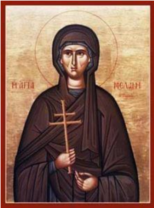
Icon of Saint Melania the Elder

Melania was a part of the first generation of Roman aristocrats who were encouraged to embrace Christianity, and lived to see it become the official religion of the Roman Empire. She was born in 341 in Spain and moved to Rome following her marriage, where she was widowed at the age of 22. Only one of her children, a son, survived, and she gave him into the care of a guardian so that she might pursue a monastic vocation.