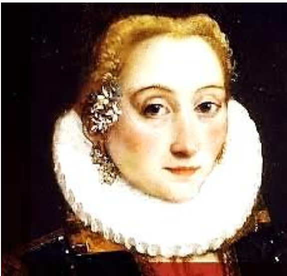
The Episcopal Church. "Elisabeth Cruciger." The Lectionary Page

From Lesser Feasts and Fasts, Church Publishing