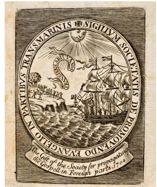
Seal of the Society for the Propagation of the Gospel in Foreign Parts, founded by Thomas Bray (1701), engraving dated 1704

When the deplorable condition of English prisons was brought to Bray's attention, he set to work to influence public opinion and to raise funds to alleviate the misery of the inmates. He organized Sunday "Beef and Beer" dinners in prisons, and advanced proposals for prison reform. It was Thomas Bray who first suggested to General Oglethorpe the idea of founding a humanitarian colony for the relief of honest debtors, but he died before the Georgia colony became a reality. From Lesser Feasts and Fasts, Church Publishing