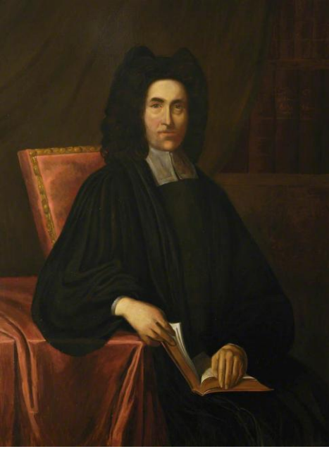
Engraving after an early portrait of Thomas Bray, early 18th century

Thomas Bray was born at Marton, in Shropshire, England, in 1656. After graduating from Oxford and being ordained as a priest, he became a country parson in Warwickshire. In 1696 he was invited by the Bishop of London to be responsible for the oversight of church work in the colony of Maryland. Three years later, as the Bishop's Commissary, he sailed to the American colonies for his first, and only, visitation.