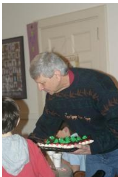
Choir School Christmas Party