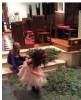
The Greening of the Church