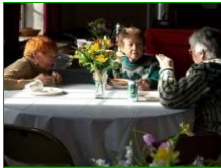
"How lovely are the messengers"