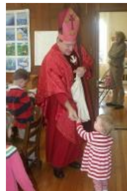
A Visit from Bp. Nicholas