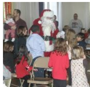
The Polar Express