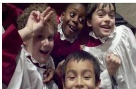
Evensong with the Choir School