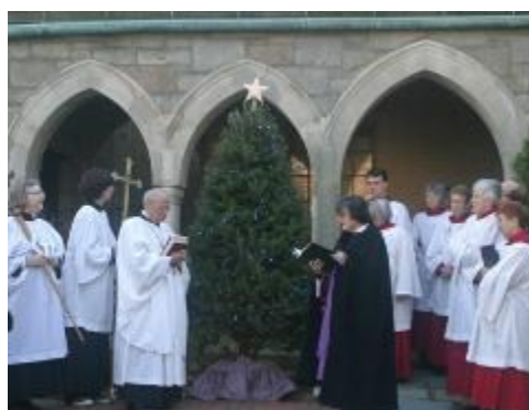
Tree of Remembrance